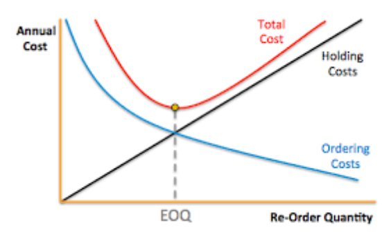
Figure 3. Economic Order Quantity Graph

Figure 3 shows economic order quantity graph. It consists of holding costs, total cost, and ordering costs.